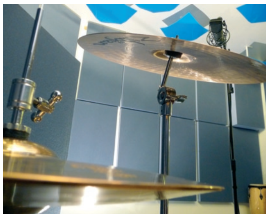
When miking cymbals, it's a good idea to minimise hi-hat bleed by positioning the mic so that the cymbal shields it from the hi-hat.

If there's a possibility you may be using samples, and you are able to do so, it's well worth recording the audio ►