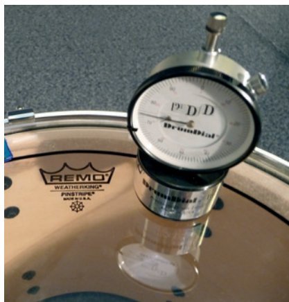
Drum tuning is a skill that can defeat novices, and devices such as the Drum Dial can provide valuable help.

► we endeavour to capture, because they are the one over which we have most control. Drum tuning is an art in itself and its importance cannot be overlooked, as even the best-quality drum kit on the market is still going to sound poor unless properly tuned. Usually I'll take the opportunity to get a kit tuned before getting into the studio, as this can be a lengthy process.