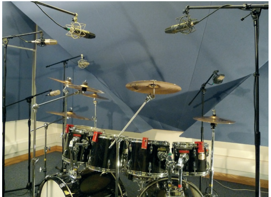
► This photo shows a fairly typical setup for recording a metal drummer. In other styles of music one might use a pair of overheads as the main foundation of the drum sound, but here, the mics above the kit are serving primarily as spot mics for individual cymbals. Note also the D-Drum triggers, used to provide spill-free signals for triggering samples at the mix.

Moving onto the overheads, my mic technique here will always be dictated by the number of cymbals being used, which, within the extreme metal genre, can be quite high. Much of the energy and driving edge of the production style is provided by the cymbals, and it is imperative that the dynamics between them are as evenly balanced as possible.