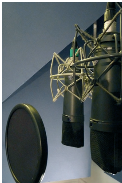
Metal vocalists often operate over a huge dynamic range, and it can be beneficial to record two microphones: a close mic for the intimate, quiet moments and a distant mic for full-on screaming.

It is usual for productions in the metal genre to have a minimum of two rhythm guitar tracks per side (ie. two rhythm guitars hard left and two tracks hard right). Occasionally, however, bands record just one guitar each side where their riffs