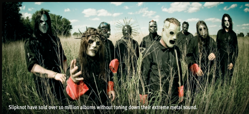
Slipknot have sold over 10 million albums without toning down their extreme metal sound.

apparent to the band on playback. It is not a given that just because the songs work well in a gig scenario, the same will apply in the studio. (It is obviously preferable to be in the same room as the band for pre-production, but when this is not possible, a certain amount of work